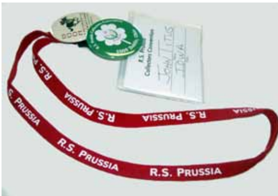
Remember to pack your lanyard!

A note from the Treasurer. The current balancer in our account is $25,273.15